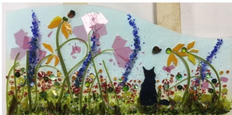
Designed project waiting to be fired

It's always a good idea to browse our Facebook page and website to find inspiration for the things you would like to make on your workshop.